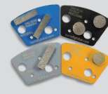
TOOLING & CONSUMABLES