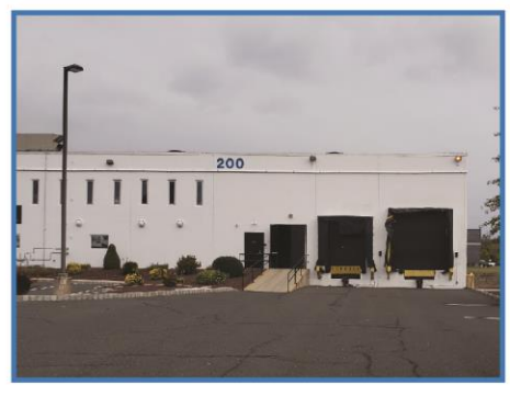
Bartell Morrison (USA) LLC

200 Commerce Drive, Unit A Freehold, New Jersey, USA 07728