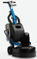
GRINDERS & POLISHERS