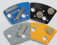
TOOLING & CONSUMABLES