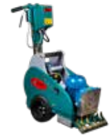
WALKBEHIND FLOOR SCRAPERS