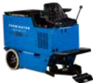
RIDE-ON FLOOR SCRAPERS