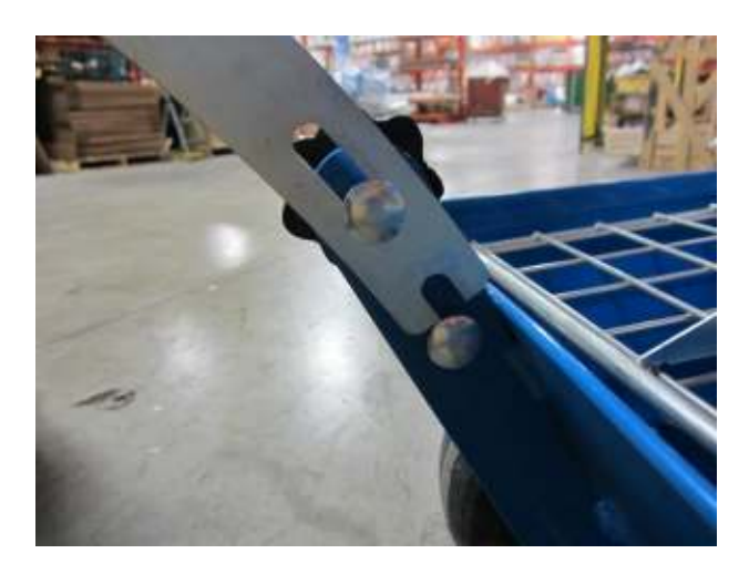
Step 5: Raise handle and align slot with stud.