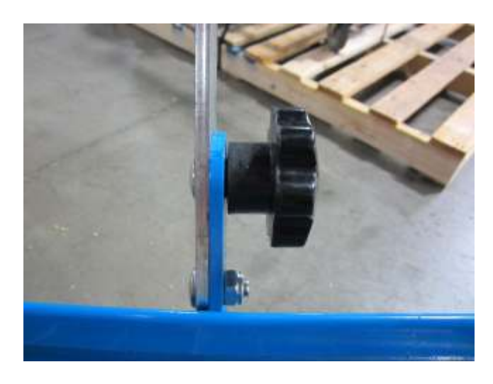
Step 7: Tighten knob to secure the handle in place