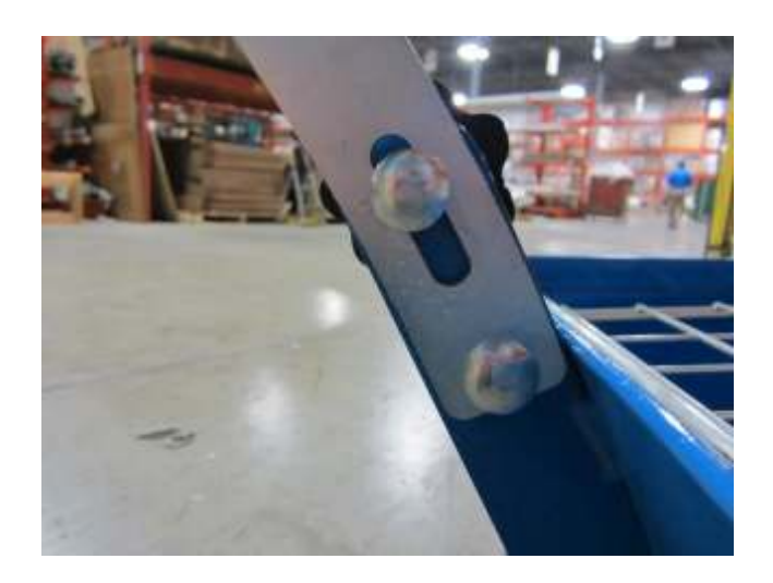
Step 6: Slide slot onto the stud