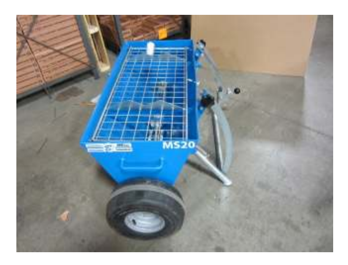
Step 4: Material Spreader shown with handle in the folded down position.