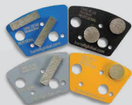
TOOLING & CONSUMABLES