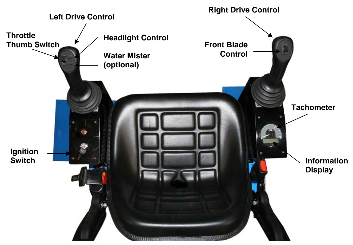
Figure 1 Operator Controls

The drive controls (two levers) are located to the right and left of the operator.