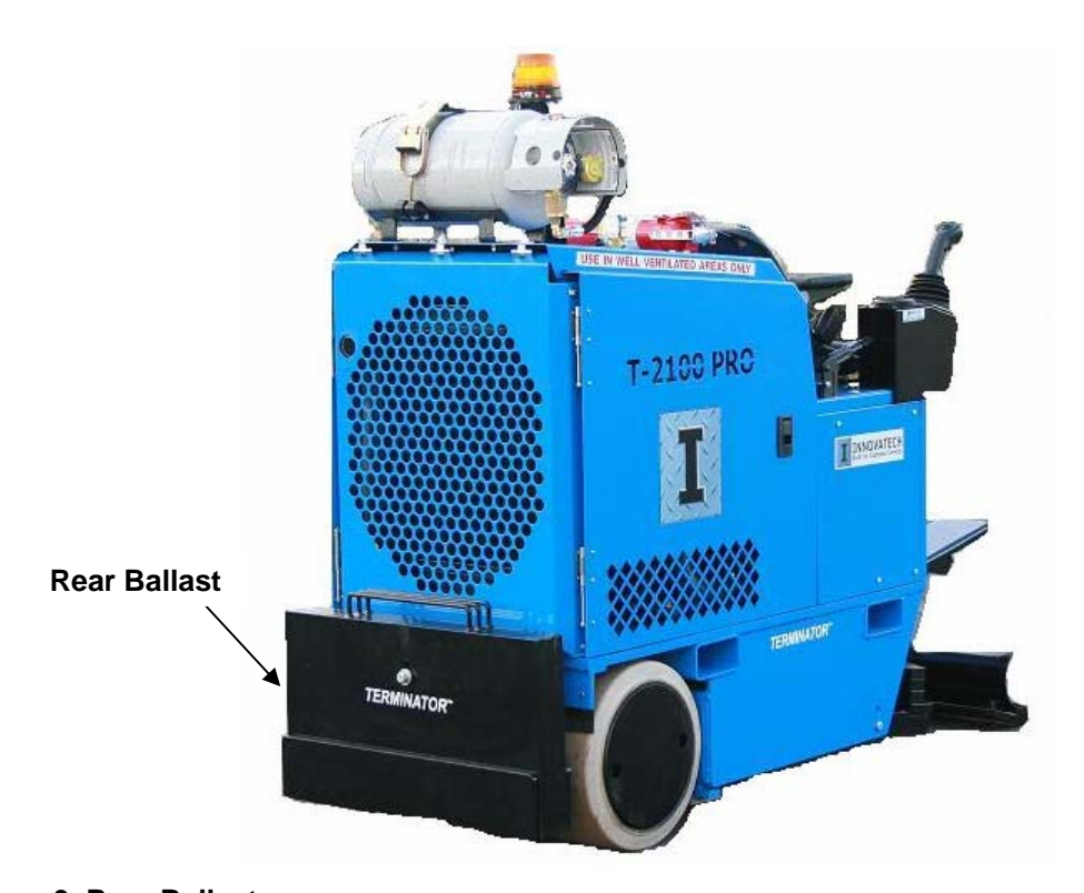
Figure 3 Rear Ballast