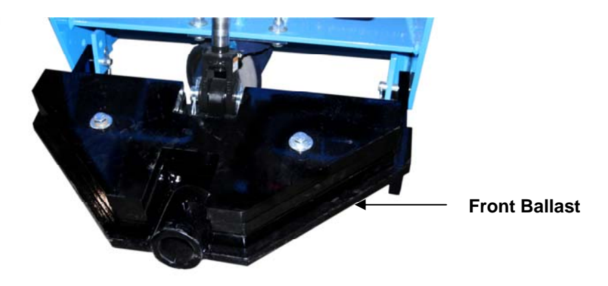
Figure 2 Front Ballast