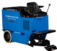
RIDE-ON FLOOR SCRAPERS