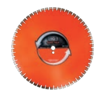
ULTIMATE ORANGE PLATINUM BLADE MAS14-125AP