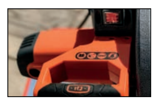
iQ POWER MANAGEMENT

Soft Start Technology reduces initial start up amperage drawn Sealed rocker power switch