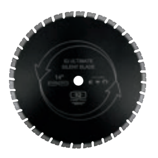
PLATINUM SILENT CORE BLADE MAS14-125AP-QT