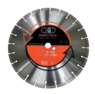
GOLD LASER WELDED BLADE MAS14-125AG