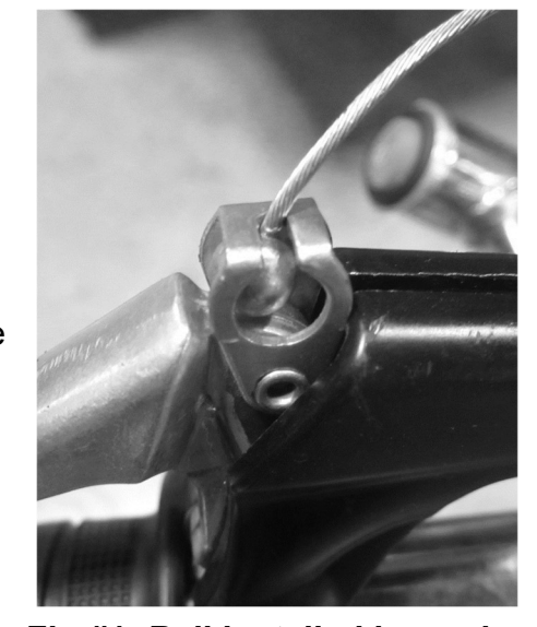
Fig #1: Ball installed in carrier