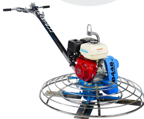
MEGA-T PRO SERIES