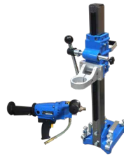
DRILLS & STANDS