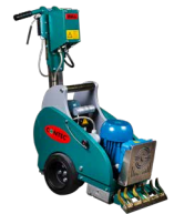
WALK-BEHIND FLOOR SCRAPERS