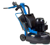
GRINDERS & POLISHERS