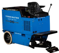
RIDE-ON FLOOR SCRAPERS