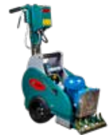
WALKBEHIND FLOOR SCRAPERS