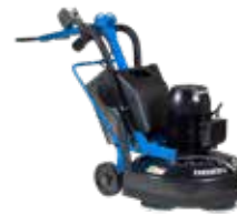
GRINDERS & POLISHERS