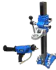
DRILLS & STANDS