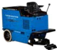
RIDE-ON FLOOR SCRAPERS